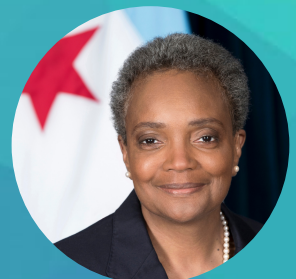
Lori E. Lightfoot, Chicago Mayor